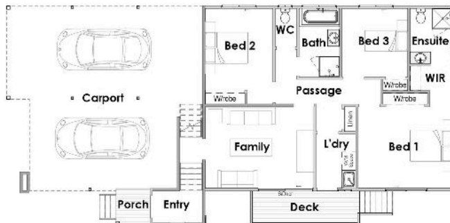
Ground & Mezzanine Floor